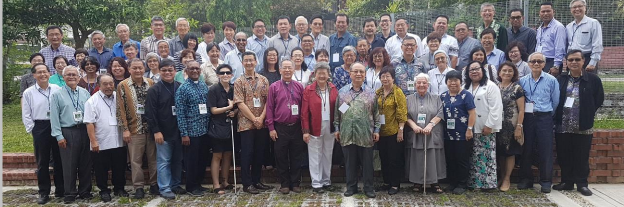
INAUGURAL ANNUAL GENERAL MEETING OF THE FEDERATION OF CHRISTIAN MISSION SCHOOLS, MALAYSIA 17 SEPTEMBER 2019 AT PETALING JAYA, SELANGOR