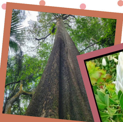
A good tree cannot produce bad fruit, ... Mt 7:17

The current Directory (updated Jan 2022) is available at: https://www.fcmsm.org/resources/directory/