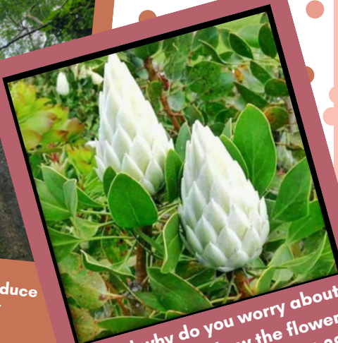
And why do you worry about clothes? See how the flowers of the field grow... Mt 6:28